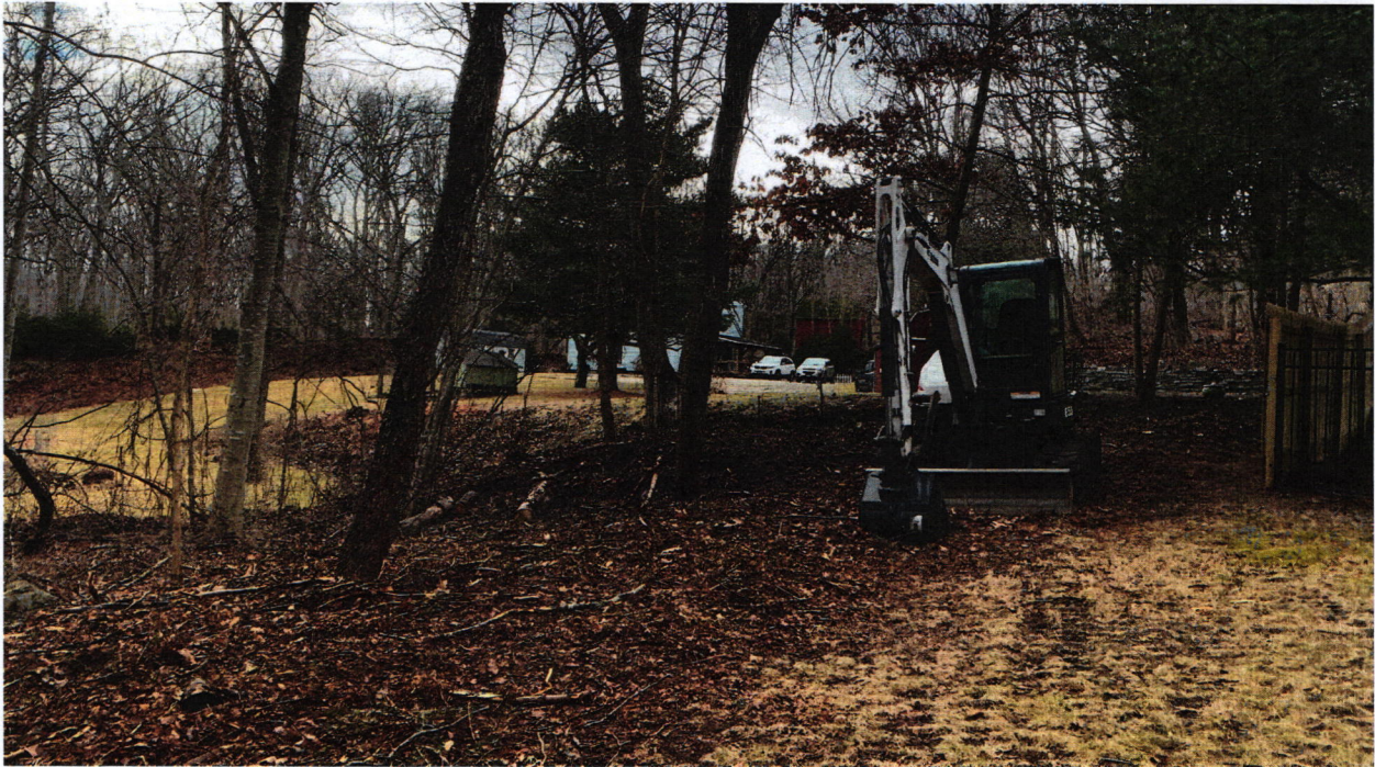
Photo 2 of the rear yard of 55 Pond Meadow Rd facing southeast after the work was done. Brush appears to have been cut and grubbed. Photo taken February 24, 2023.