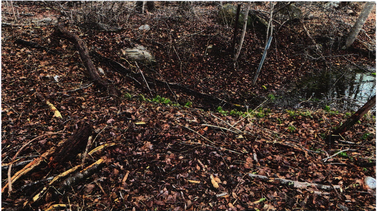
Photo 4 of the rear yard of 55 Pond Meadow Rd facing northeast after the work was done. It's not clear if there is a pipe located in the embankment that is the source of the water that empties into the pond. Photo taken February 24, 2023 by Carey Duques.