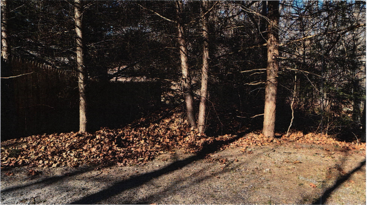
Photo 1a of the rear yard of 55 Pond Meadow Road before work was completed. Area is located within 100 feet of a wetlands. Photo taken February 14, 2023 by Carey Duques