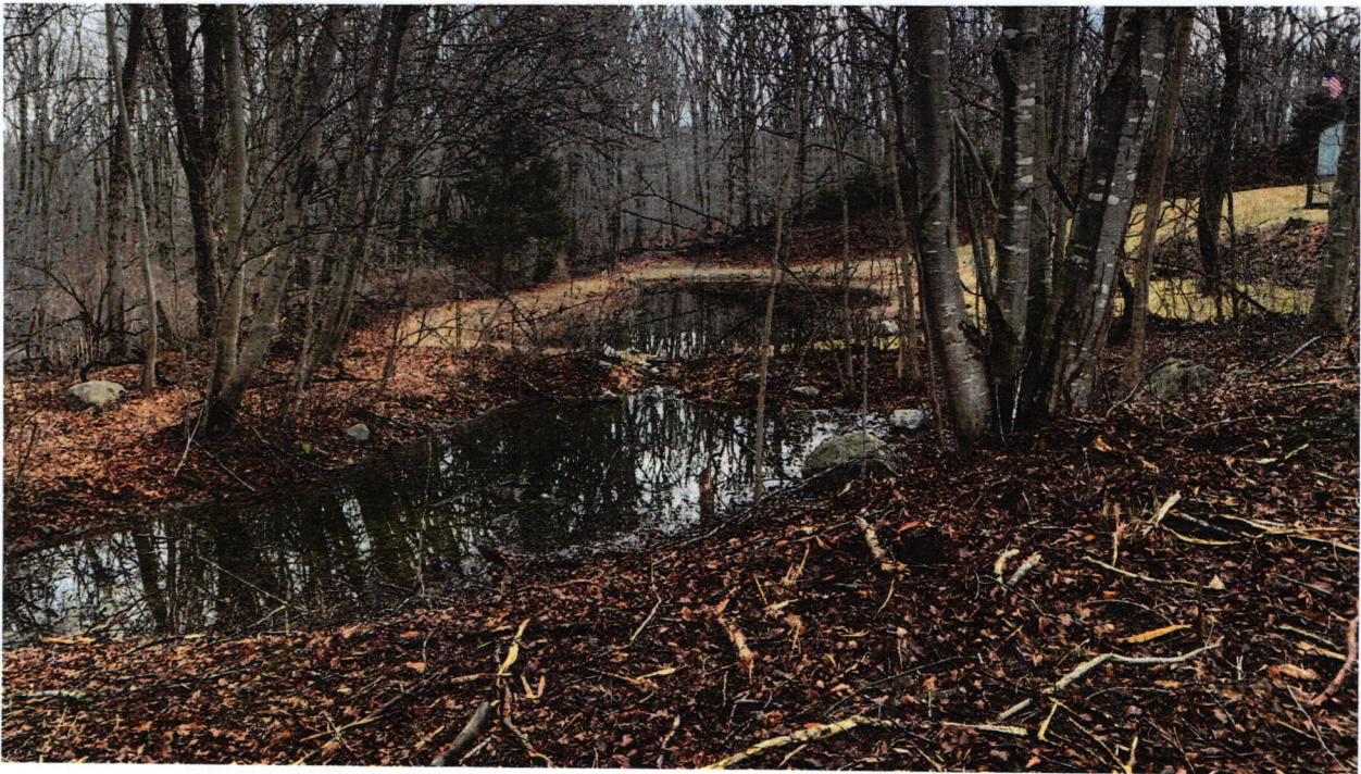
Photo 3 of the rear yard of 55 Pond Meadow Rd facing east after the work was done. Tree stumps were not noticed. Appears that brush and smaller growth was cut. Erosion was not observed on the site. Photo taken February 24, 2023 by Carey Duques.