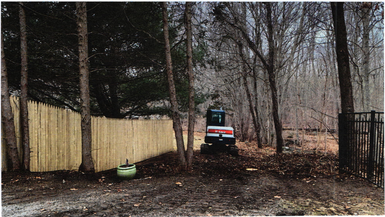
Photo 1b of the rear yard of 55 Pond Meadow Rd after the leaf pile was removed and brush and 1 pine tree was cut. Photo taken February 21, 2023 by Carey Duques.