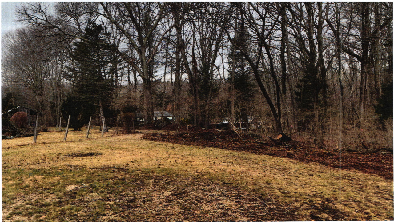
Photo 5 of the rear yard of 55 Pond Meadow Rd facing north after the work was done. Photo taken February 24, 2023 by Carey Duques.