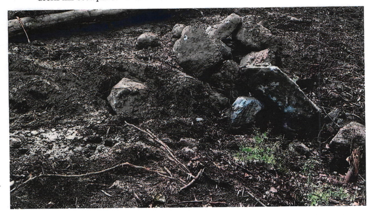
Photo 16 facing west looking at the stream from the side of the stream closest to Johnny Cake Lane. The stream runs under the dirt and debris and emerges by the boulders. Photo taken June 2, 2023 by Carey Duques