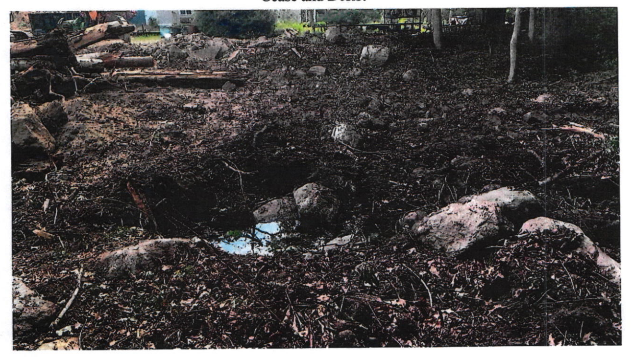
Photo 13 facing northwest taken from the side of the stream closest to Johnny Cake Lane. The stream is in the foreground of the photo and runs from left to right. Photo taken June 2, 2023