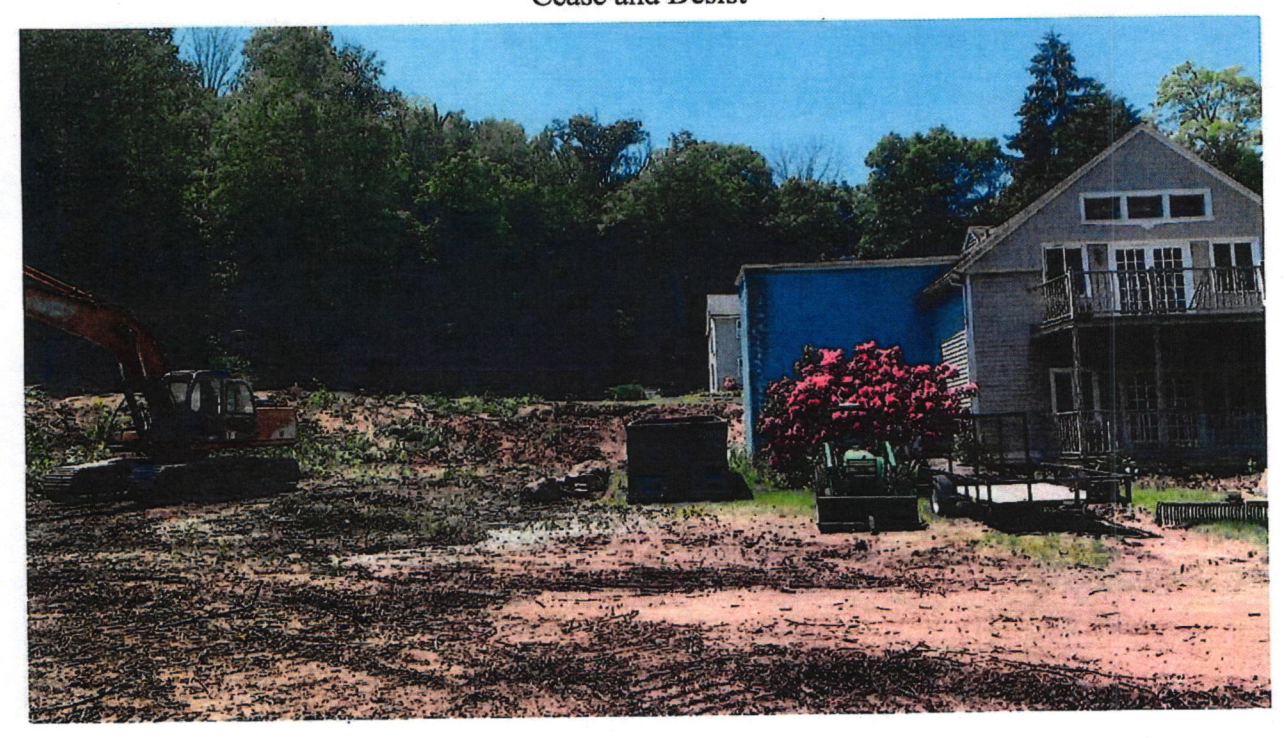
Photo 5 facing west. The guesthouses of the Copper Beech Inn are on the right side of the photo. The area was cleared of all vegetation without a permit. Photo taken June 2, 2023 by Carey Duques