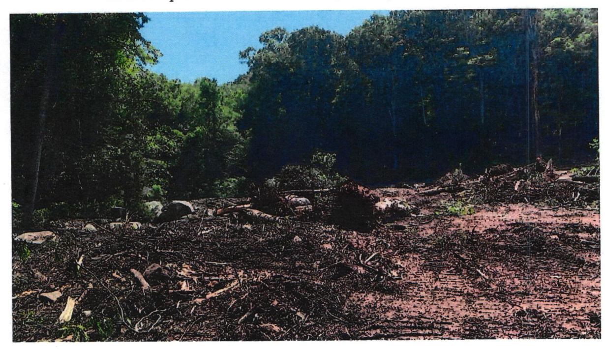
Photo 2 facing south. The area was cleared of all vegetation without a permit. Photo taken June 2, 2023 by Carey Duques