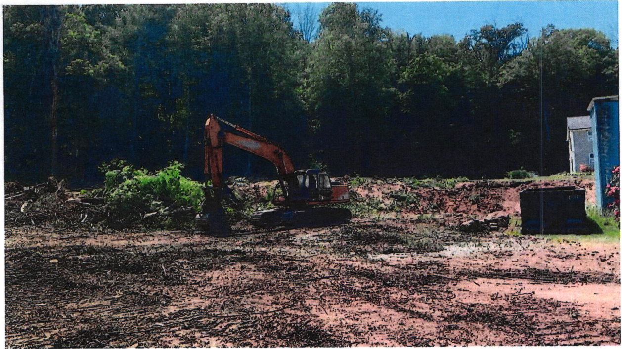
Photo 4 facing west. The guest houses of the Copper Beech Inn are to the right of the photo. The area was cleared of all vegetation without a permit. Photo taken June 2, 2023 by Carey Duques