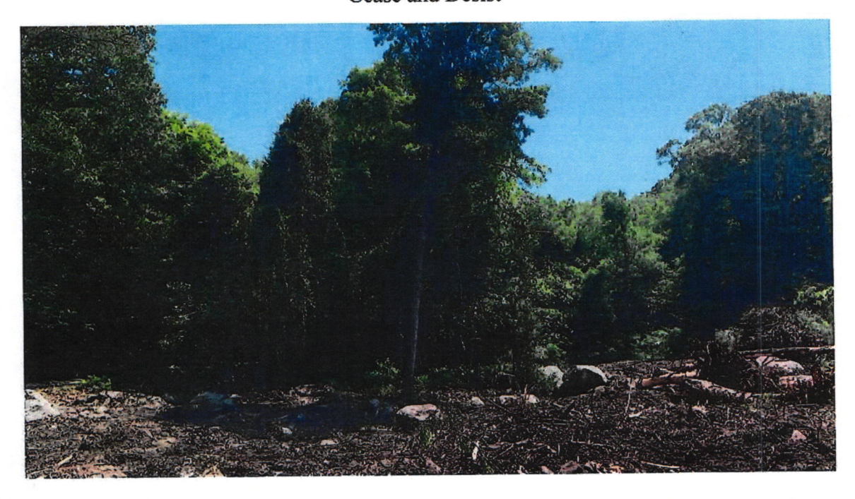
Photo 1 facing southeast, Johnny Cake Lane is to the left of the photo. The stream is to the lower left in the photo and continues to the middle of the photo. The area was cleared of all vegetation without a permit. Photo taken June 2, 2023 by Carey Duques