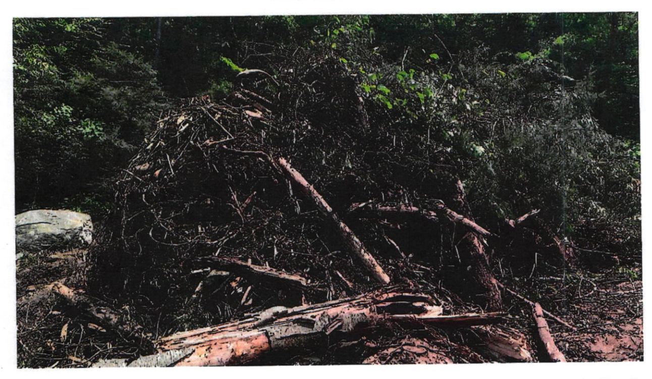
Photo 9 facing southeast, approximately midway into the rear of the property is a brush pile of vegetation that was cleared without a permit. Photo taken June 2, 2023