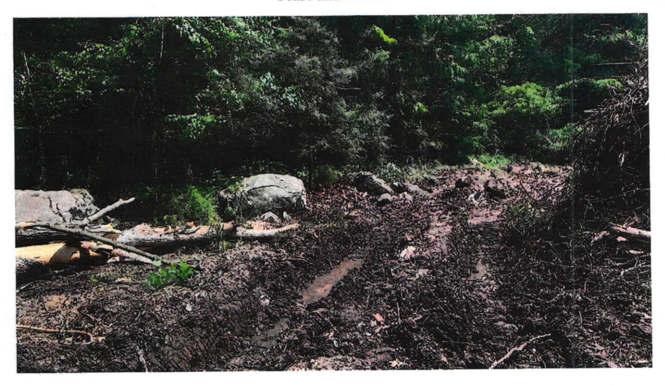
Photo 7 facing southeast. Standing water visible in the foreground of the photo where the excavator sank into the soil. Photo taken June 2, 2023 by Carey Duques