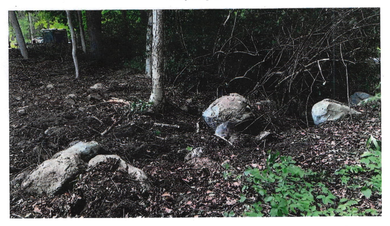
Photo 14 facing north taken from the side of the stream closest to Johnny Cake Lane. The stream is in the foreground of the photo between the boulders and runs from left to right. Photo taken June 2, 2023 by Carey Duques