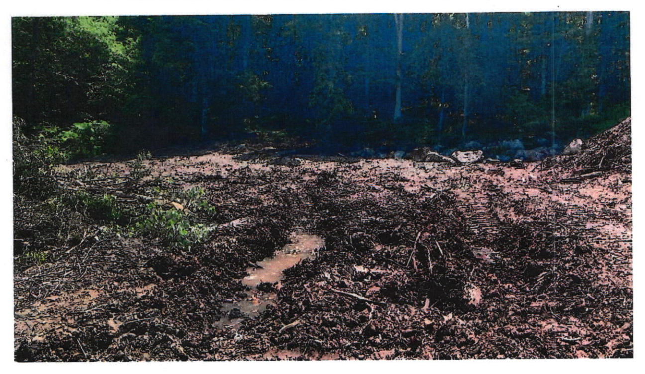
Photo 8 facing south, after walking further into the property away from the guest houses of the Copper Beech Inn. Standing water visible where tracks from the machinery exist. Photo taken June 2, 2023 by Carey Duques