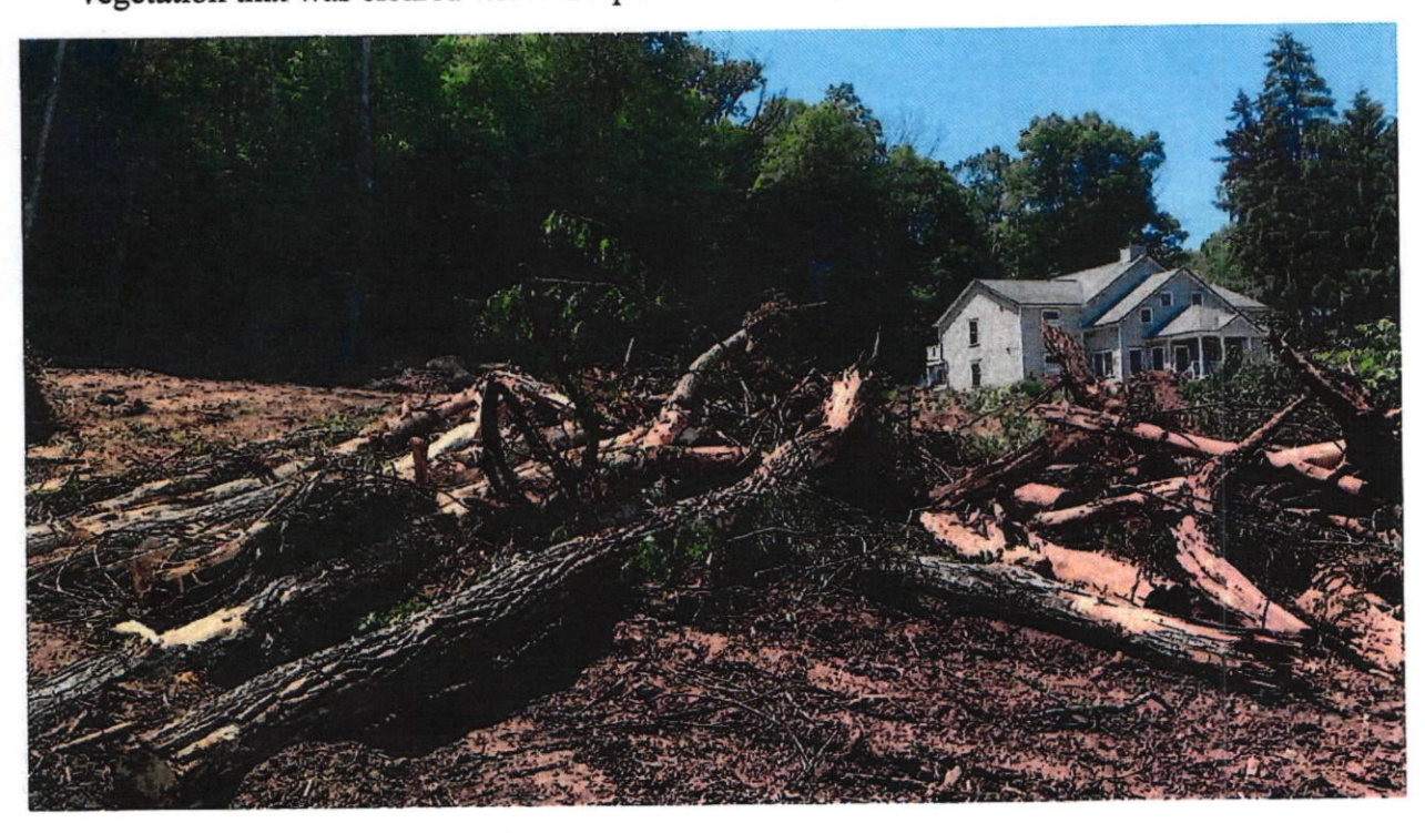
Photo 10 facing northwest, the guest house on the western side of the property is in the background. Piles of trees and brush removed without a permit in the foreground. Photo taken June 2, 2023