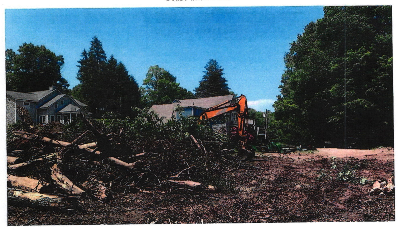
Photo 11 facing north, pile of brush in the foreground and guest houses of Copper Beech Inn in the background. Photo taken June 2, 2023