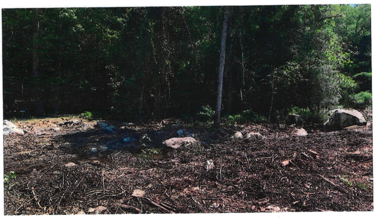
Photo 6 facing southeast, Johnny Cake Lane is to the left of the photo. The stream is to the lower left in the photo and continues to the middle of the photo. Standing water is visible in the photo. Photo taken June 2, 2023 by Carey Duques