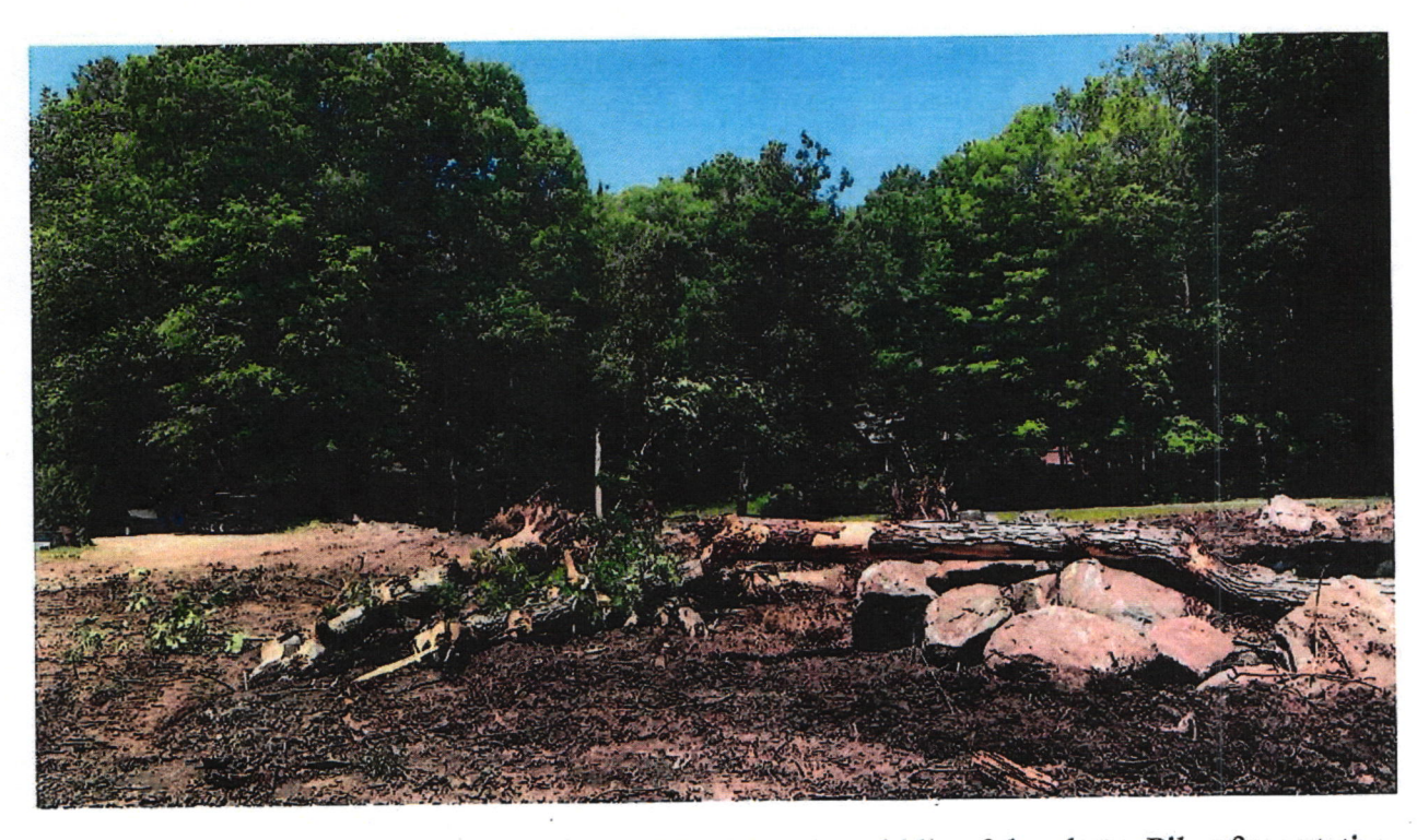
Photo 12 facing northeast, Johnny Cake Lane is along the middle of the photo. Pile of vegetation and stones removed without permits.