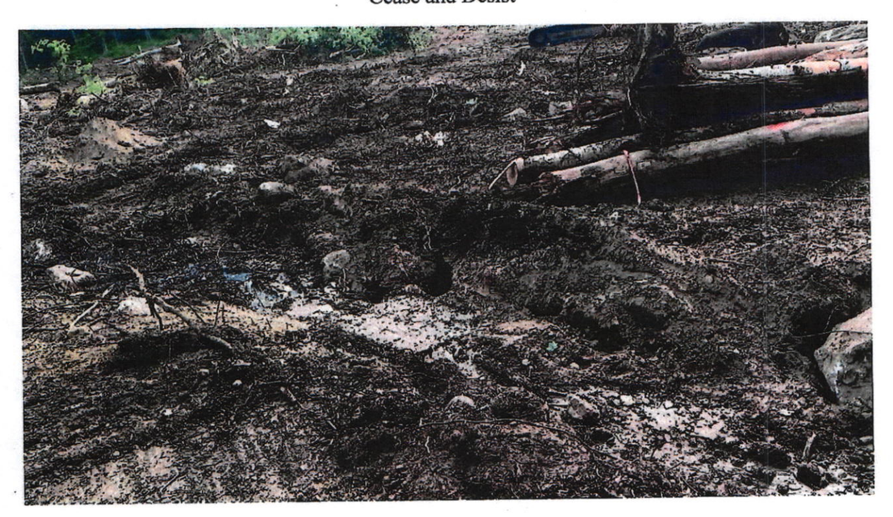
Photo 15 facing south looking at the stream from the side closer to Johnny Cake Lane. Dirt and debris has been placed in the stream. Photo taken June 2, 2023 by Carey Duques