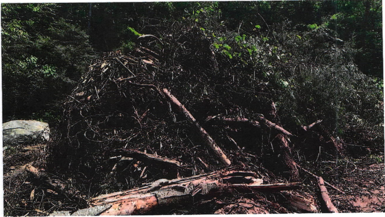
Photo 9 facing southeast, approximately midway into the rear of the property is a brush pile of vegetation that was cleared without a permit. Photo taken June 2, 2023 by Carey Duques