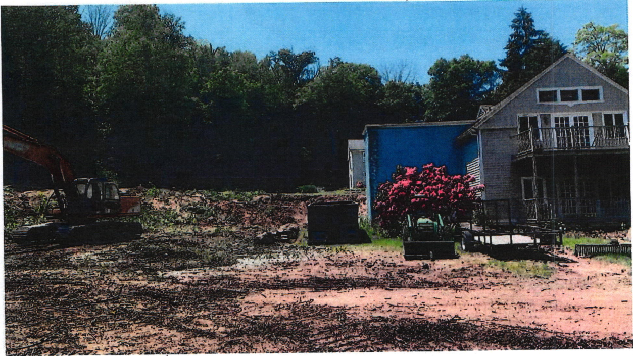
Photo 5 facing west. The guesthouses of the Copper Beech Inn are on the right side of the photo. The area was cleared of all vegetation without a permit. Photo taken June 2, 2023 by Carey Duques