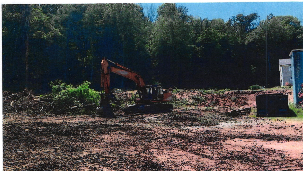
Photo 4 facing west. The guest houses of the Copper Beech Inn are to the right of the photo. The area was cleared of all vegetation without a permit. Photo taken June 2, 2023 by Carey Duques