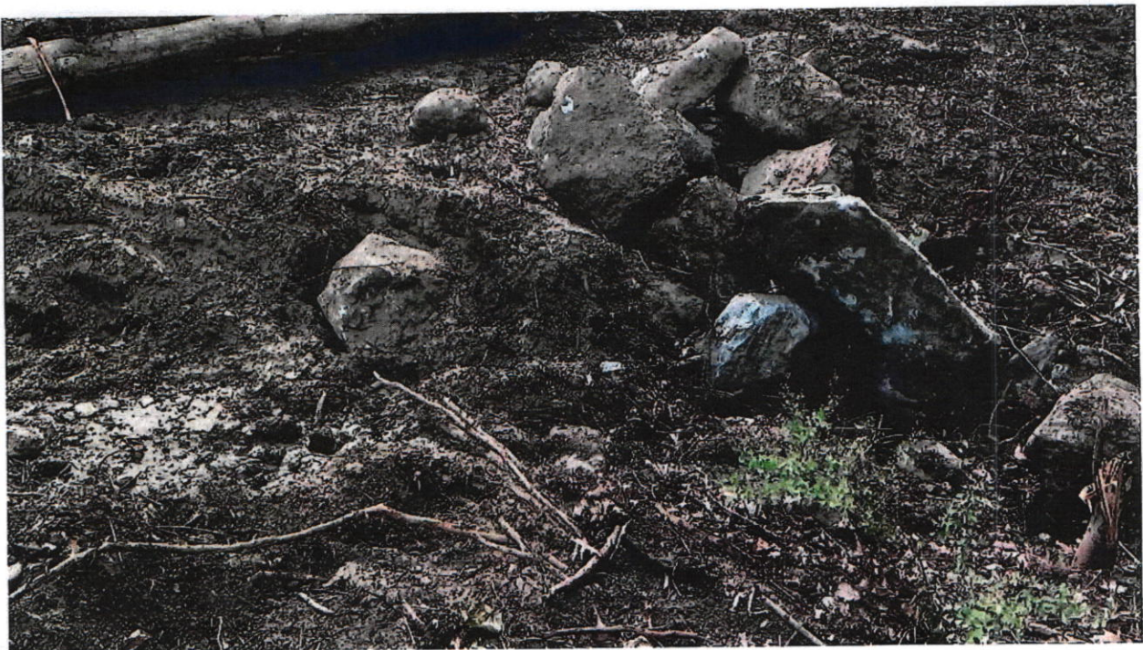
Photo 16 facing west looking at the stream from the side of the stream closest to Johnny Cake Lane. The stream runs under the dirt and debris and emerges by the boulders. Photo taken June 2, 2023