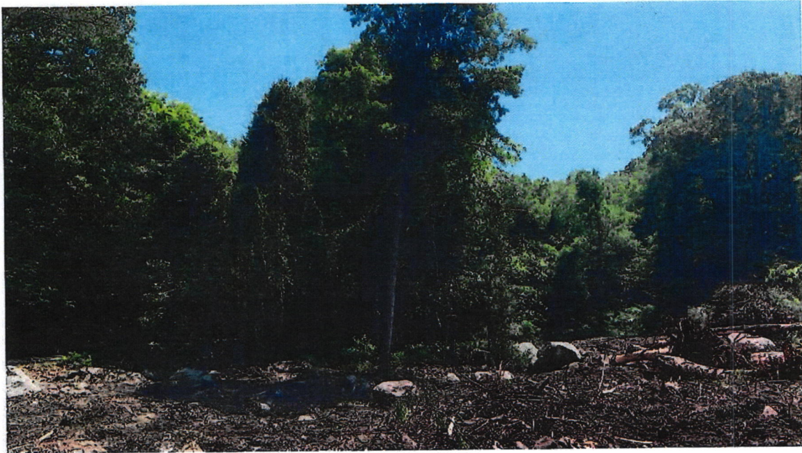
Photo 1 facing southeast, Johnny Cake Lane is to the left of the photo. The stream is to the lower left in the photo and continues to the middle of the photo. The area was cleared of all vegetation without a permit. Photo taken June 2, 2023 by Carey Duques