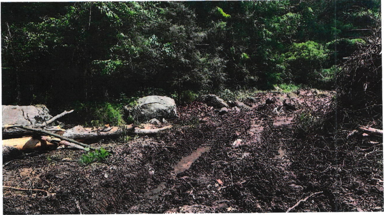
Photo 7 facing southeast. Standing water visible in the foreground of the photo where the excavator sank into the soil. Photo taken June 2, 2023 by Carey Duques