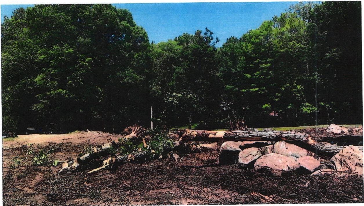
Photo 12 facing northeast, Johnny Cake Lane is along the middle of the photo. Pile of vegetation and stones removed without permits.