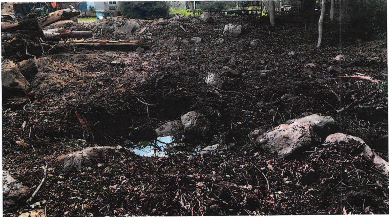
Photo 13 facing northwest taken from the side of the stream closest to Johnny Cake Lane. The stream is in the foreground of the photo and runs from left to right. Photo taken June 2, 2023 by Carey Duques