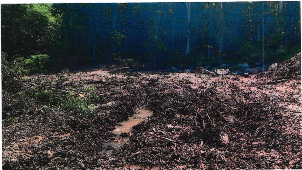
Photo 8 facing south, after walking further into the property away from the guest houses of the Copper Beech Inn. Standing water visible where tracks from the machinery exist. Photo taken June 2, 2023 by Carey Duques