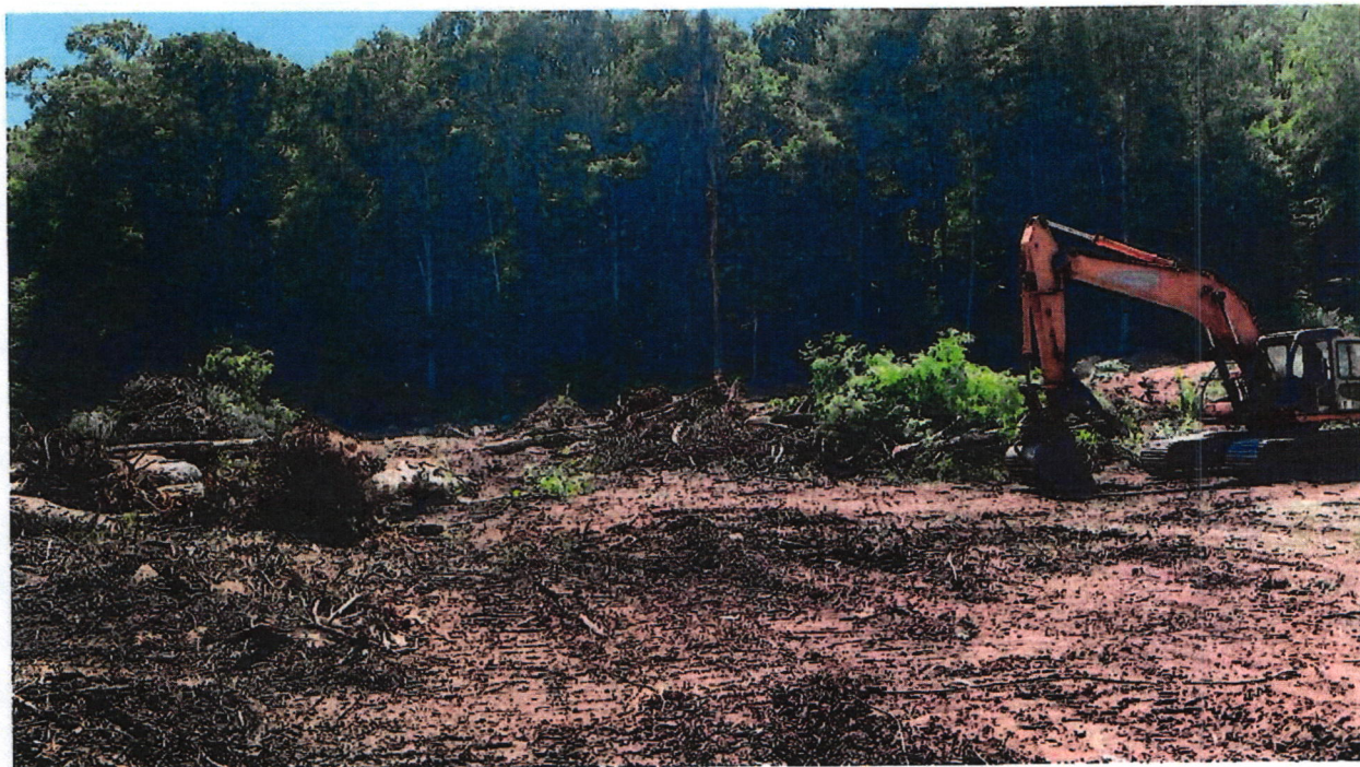
Photo 3 facing southwest. The area was cleared of all vegetation without a permit. Photo taken June 2, 2023