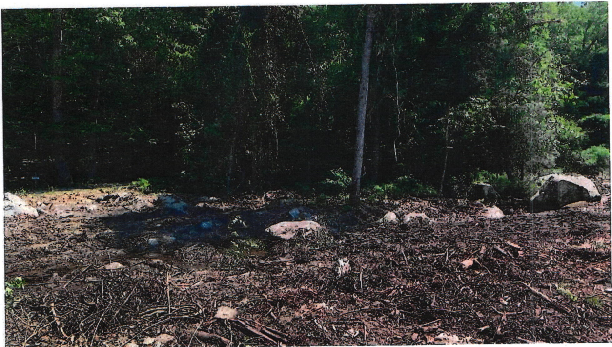
Photo 6 facing southeast, Johnny Cake Lane is to the left of the photo. The stream is to the lower left in the photo and continues to the middle of the photo. Standing water is visible in the photo. Photo taken June 2, 2023