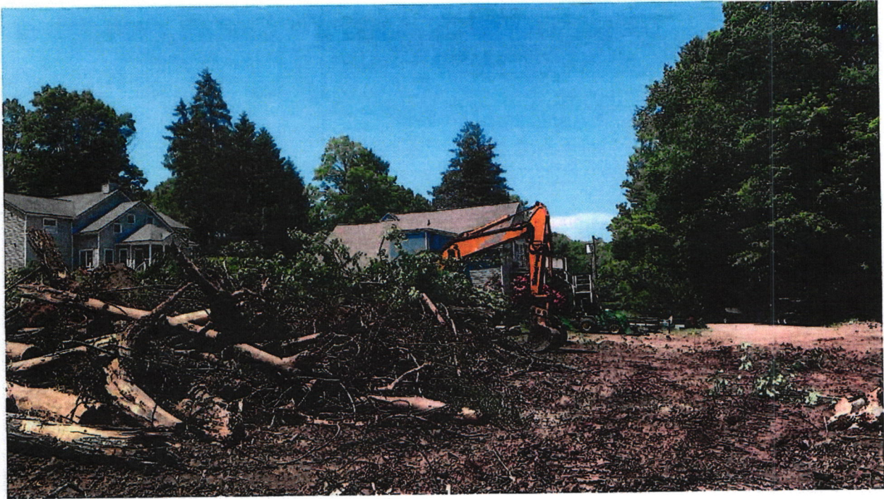
Photo 11 facing north, pile of brush in the foreground and guest houses of Copper Beech Inn in the background. Photo taken June 2, 2023