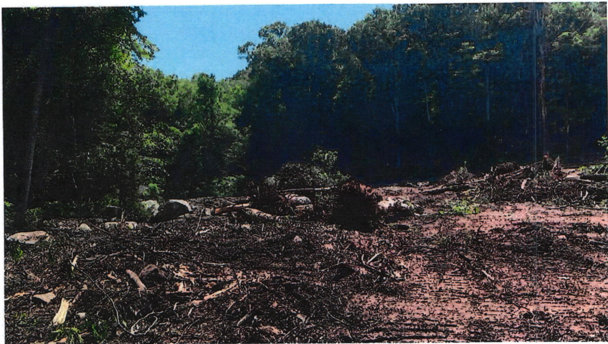
Photo 2 facing south. The area was cleared of all vegetation without a permit. Photo taken June 2, 2023