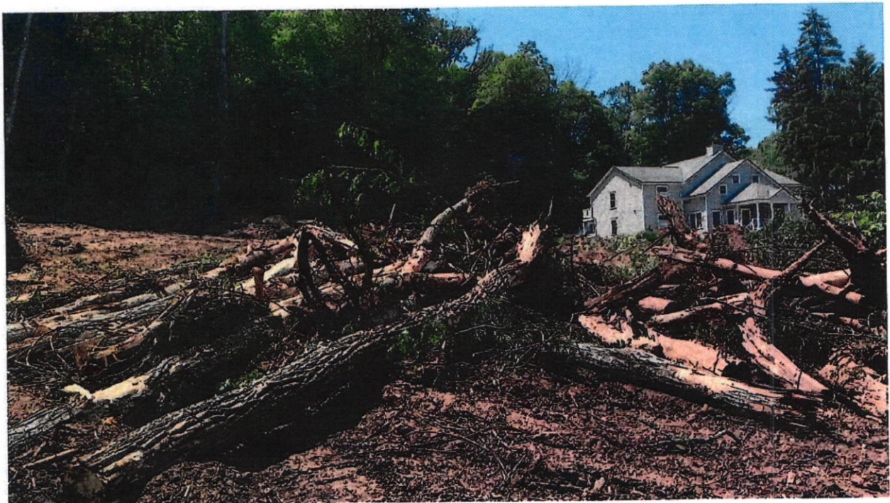
Photo 10 facing northwest, the guest house on the western side of the property is in the background. Piles of trees and brush removed without a permit in the foreground. Photo taken June 2, 2023 by Carey Duques