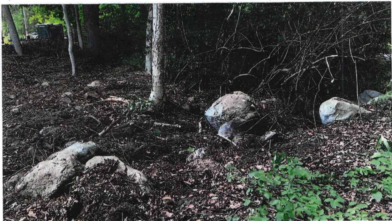
Photo 14 facing north taken from the side of the stream closest to Johnny Cake Lane. The stream is in the foreground of the photo between the boulders and runs from left to right. Photo taken June 2, 2023