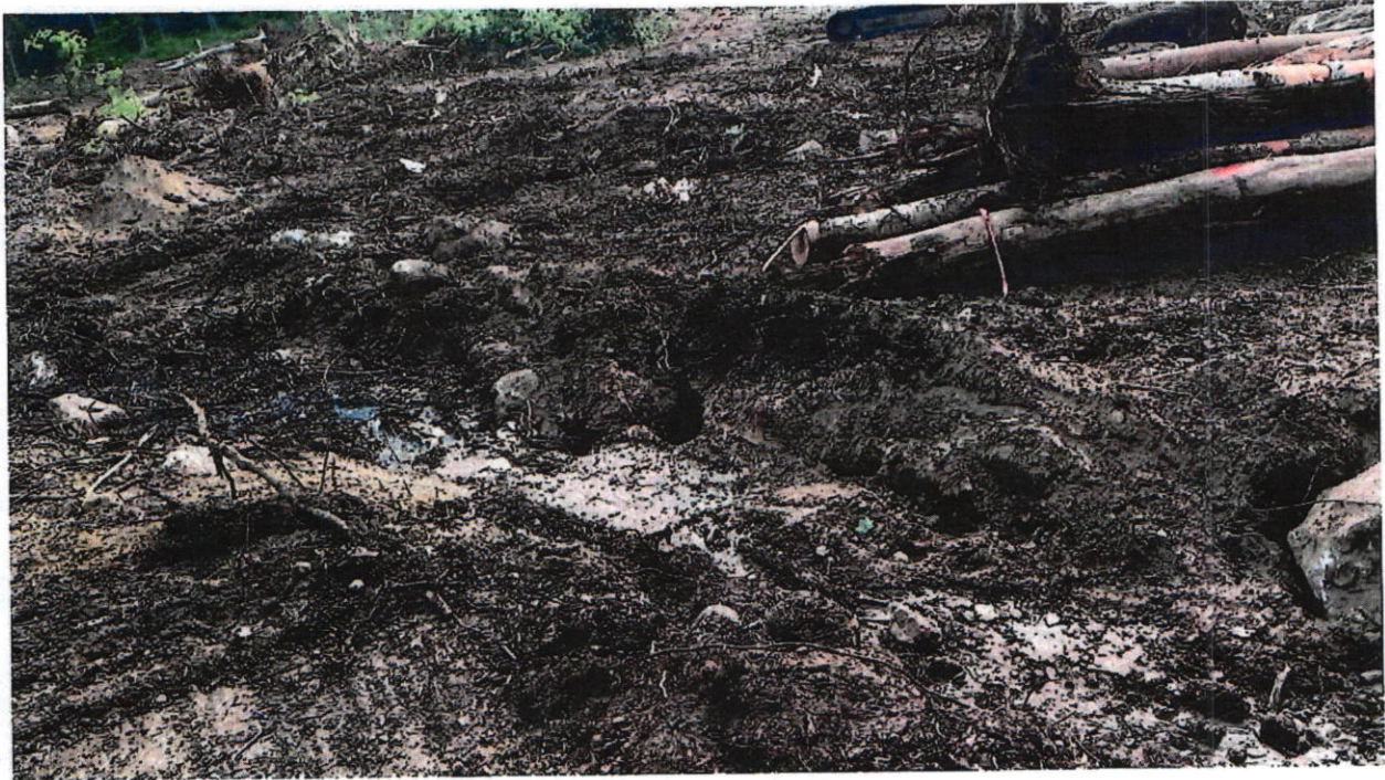
Photo 15 facing south looking at the stream from the side closer to Johnny Cake Lane. Dirt and debris has been placed in the stream. Photo taken June 2, 2023 by Carey Duques