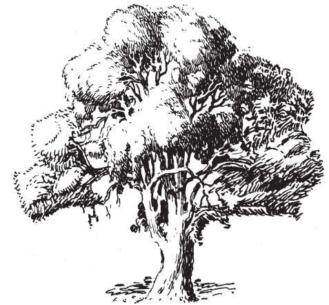
The Wolf Tree